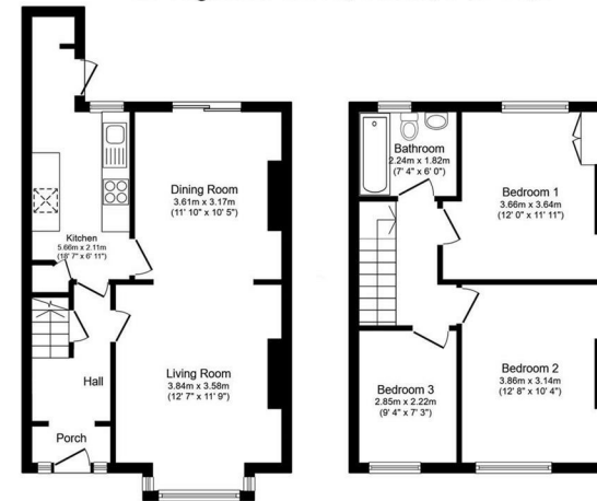
21 Highfield Grove, Bristol, BS7 8QH

Total floor area: 84.3 sq.m. (908 sq.ft.)